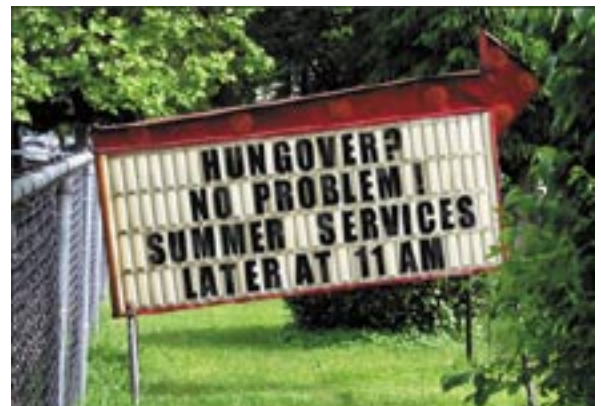
Church Sign of the Month